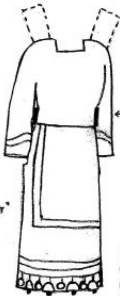
Blue Ephod 2 piece vest joined at shoulders (v.6-8)

← (cut slits in | for sash to slide through)