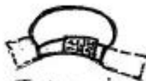
Turban with front plate of gold inscribed "Holiness to the Lord" (v.36)