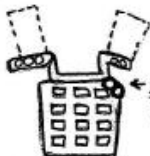
Urim & Thummin stones over the heart (v.30)

Robe hem trimmed with pomegranates and bells (v.35) Blue, purple & scarlet